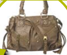
New Look £26.24