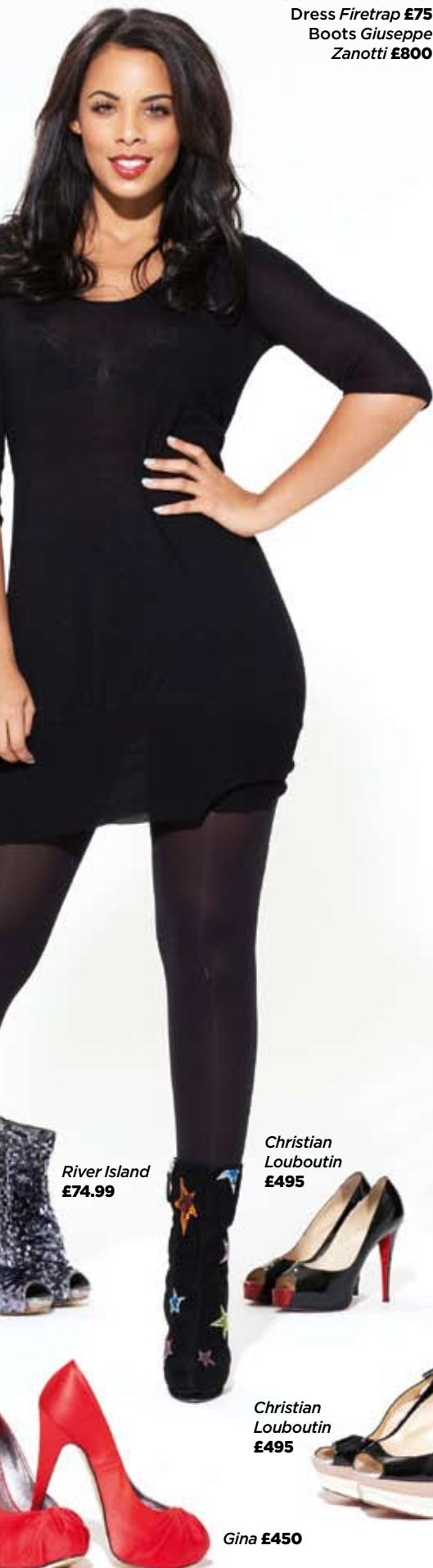
ROCHELLE WEARS: Dress Firetrap £75 Boots Giuseppe Zanotti £800